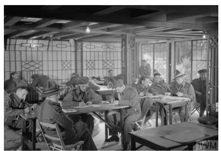
Figure 2. New Zealand POWs writing letters home at Margate.<sup>44</sup>

Hobbs suggests the staff were careful not to turn the rehabilitation centre into a different sort of prison. The men were treated as civilians, not captives, or even soldiers. This emphasis on forgetting their captivity was significant, because Hobbs' statement was underlined by a sense of brokenness. The need to bring them 'back to full health and strength' implied their experience had not only impacted their physically, but also it had left its mark mentally. Figure I shows New Zealand POWs enjoying the hospitality of a local family in Kent. As Hobbs indicates, these encounters provided a chance to fully immerse oneself in the civilian world again.