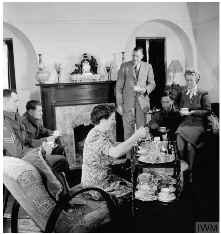
Figure 1. Locals provide hospitality to New Zealand POWs in Kent.<sup>38</sup>

Preparations for how to accommodate approximately 8000 New Zealand POWs in Britain began in earnest in March 1944.<sup>39</sup> However, procuring sufficient housing proved difficult. In New Zealand's official war history, W. Wynne Mason states that the headquarters for repatriation was meant to be at Dover, but had to be changed at the last moment to accommodate a leave centre for other British troops.<sup>40</sup> Despite these setbacks, the fifty properties requisitioned at Folkestone, Margate and Westgate 'had far greater possibilities for the creation of the type of rest centre visualised for repatriates.'<sup>41</sup> Many of these buildings were seaside hotels prior to the war, which