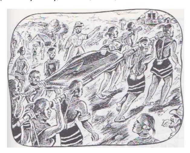
Figure 4: Evacuation of wounded by Naga Porters. 67

The war diaries record the four Essex and Royal Artillery columns moving over single file tracks once they left Phakekedzumi, and as they went southeast the terrain became higher, the tracks narrower, less common, more overgrown, steeper and more precipitate in terms of drops to one side. The tracks also provided perfect cover for ambushes which pressed on the minds of the leading platoons. By this time these columns were reliant on Naga porters as the mules had been left behind.