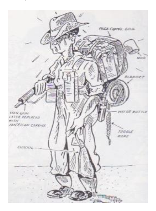
Figure I: By Sergeant Arthur Sampson - a 23 Brigade Chindit. 16

progressed in absolute silence, even the mules had been silenced by having their vocal chords cut, there were only whispers at the nightly bivouac, and often no fires to heat water and food. The columns' mules carried radio sets, medical equipment, 3-inch mortars, Vickers machine guns, flamethrowers and some small anti-tank weapons.