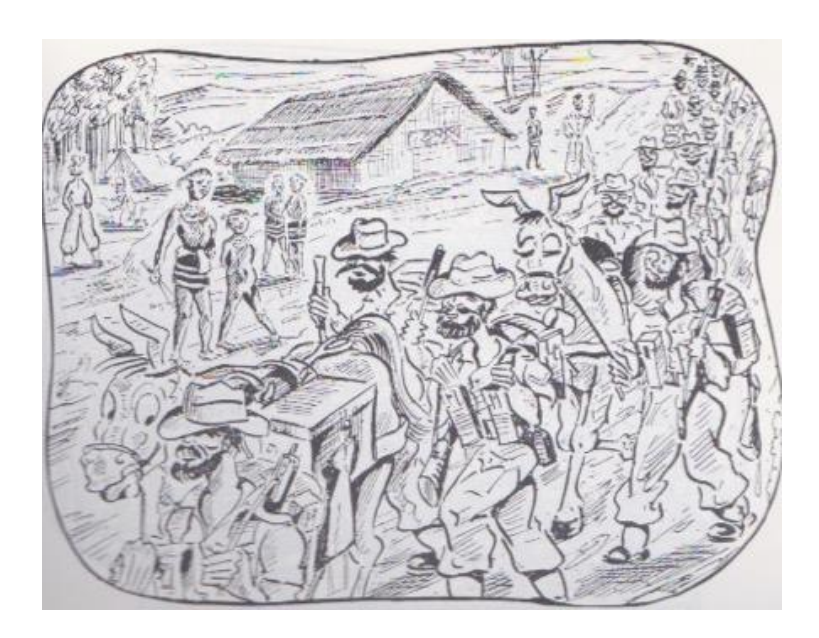
Figure 2: Column 32 leaves Grimsby II for Ukhrul. 17

Elsewhere in Burma, the British had by 1944 learnt not to retreat when surrounded or outflanked by the Japanese. Instead a fortified box was created and all within it would fight on while supported by air dropped supplies and Royal Air Force (RAF) fighter bombers. The February 1944 Battle of the Admin Box in the Arakan Division was an example of this successful new tactic. It was applied again at Kohima and Imphal.<sup>18</sup>