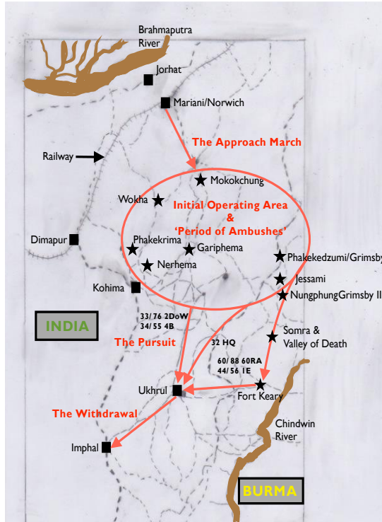
Figure 3: 23 Brigade Operations Area – Not to scale – approx.: 1 mile/mm 58

Surprisingly, it is difficult to know exactly where the brigade's strongholds were located, perhaps because they proved to be of much less importance to the brigade than was the case for Operation Thursday where whole brigades and large volumes of supplies, including field artillery, were flown into airstrips big enough for transport aircraft operations. The mountainous Naga Hills precluded the building of such large airstrips. Neither were the strongholds used as defended bases from which columns