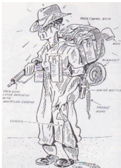
Figure 1: By Sergeant Arthur Sampson – a 23 Brigade Chindit. 16

progressed in absolute silence, even the mules had been silenced by having their vocal chords cut, there were only whispers at the nightly bivouac, and often no fires to heat water and food. The columns' mules carried radio sets, medical equipment, 3-inch mortars, Vickers machine guns, flamethrowers and some small anti-tank weapons.