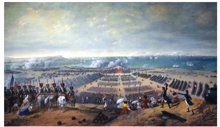
Image 2: 16 August 1804, Napoleon reviews the troops and fleet at Boulogne – a far more successful event than that the month prior.

clamped together and then run aground at the harbour entrance where they would be torched; the intention being that the masonry would sink at the mouth and block it permanently. Most peculiarly, avoiding any form of operational security, the preparations went ahead amidst a blaze of publicity only for the weather to scupper the plan.<sup>32</sup> A second attempt in October 1804 was a more scientific affair. Pitt met with a number of inventors to consider novel ways of attacking the French before they could put to sea. Robert Fulton, an American inventor who had failed to raise interest with the French Admiralty over his new submarines, came to Britain and proposed a plan of attack on Boulogne using fireships, torpedoes and mines.<sup>33</sup> His plan was adopted; however, the French lookouts spotted the British force well out to sea and executed a series of well organised contingency plans to counter. When the heavy French guns opened fire, the British crews steered full ahead, set the fuses and abandoned their respective ships. The results were visually spectacular but accomplished little.