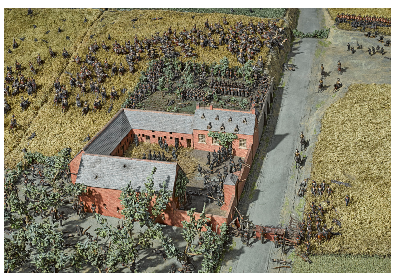
Image 3: Siborne was able to use the accounts of the defense of La Haye Sainte to make it one of the most detailed areas of the model.