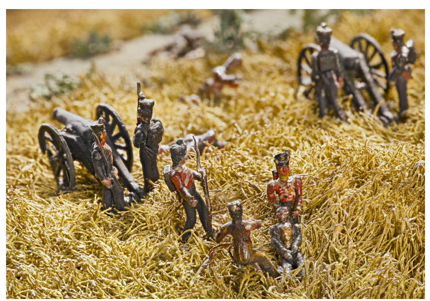
Image 10: The death of Sir Thomas Picton in the rear of Roger's company Royal Artilery. Note the double trail on the gun carriage more reminiscent of the Gribeauval system, and the French infantrymen manning the guns.