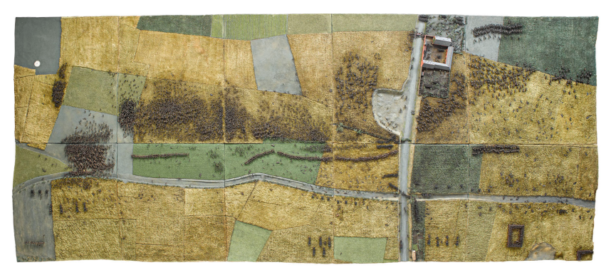
Image 6: Photograph showing the model's condition in May 2015 after the most recent conservation. A comparison with the previous image also shows some of the work carried out by the Ancient Monuments Lab and the Model Unit in 1983.