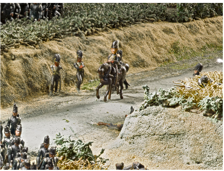
Image 9: The gunners of Ross' troop Royal Horse Artillery, minus their guns, on the road just north of the crossroads.