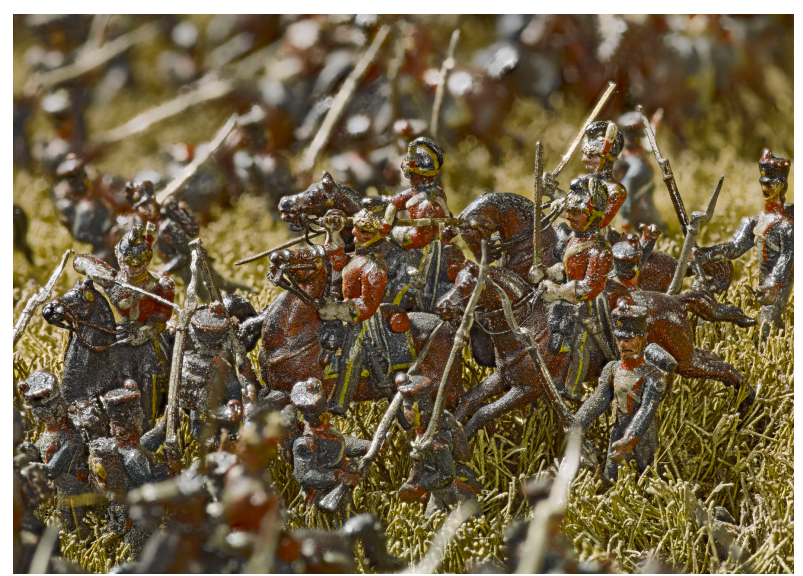
Image 2: Captain Clark leading the charge of center squadron of 1<sup>st</sup> (Royal) Dragoons. The Eagle of the 105<sup>th</sup> Line Regiment is missing.