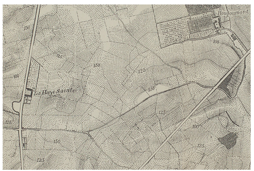
Image 1: Detail from Siborne's plan of the battlefield showing the right centre of the Allied line including the section damaged by the construction of the Lion Mound. From H.T. Siborne, ed., Waterloo letters, (London, Cassell, 1891).