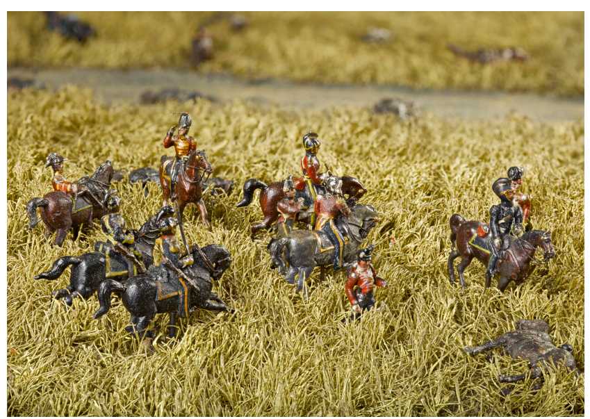
Image 7: The replacement figure of the Duke of Wellington (mounted on the chestnut charger) in the scarlet uniform of a General officer and not his blue frock coat.