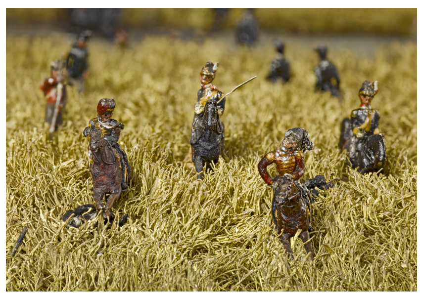
Image 8: The relocated figure of Lord Uxbridge dressed in the uniform of a colonel of the 7^{th} Hussars.